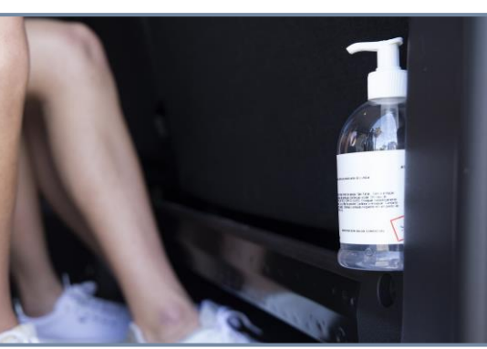
Alcohol gel by the entrance