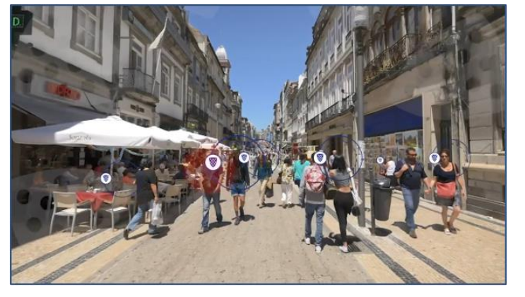
Click to watch the video